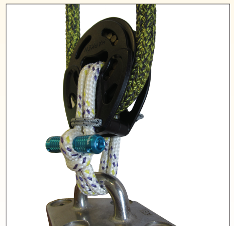
Dogbone on loop to connect block