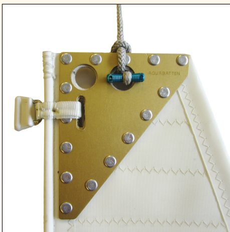
Dogbone as Halyard

Available in seven different sizes from 6mm to 18mm