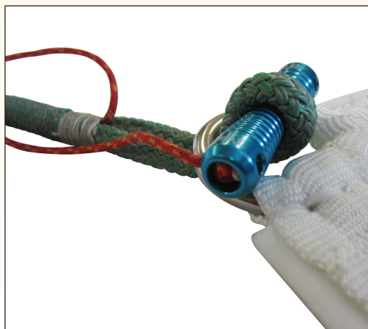
Dogbone used to terminate a sheet