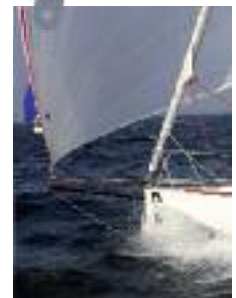
*Wire non delivered