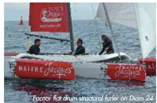
Facnor flat drum structural furler on Diam 24

Perfect for racing boats : The 3T flat drum structural furler is compact, the discontinuous line is of vectran (diam. 5mm). The low profile mechanism offers a longer luff and its large diameter a strong furling power (diam 98 mm). It is easy to operate with the partially reduced diameter line.