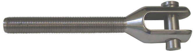
Threaded Terminals - Fork Studs RH & LH